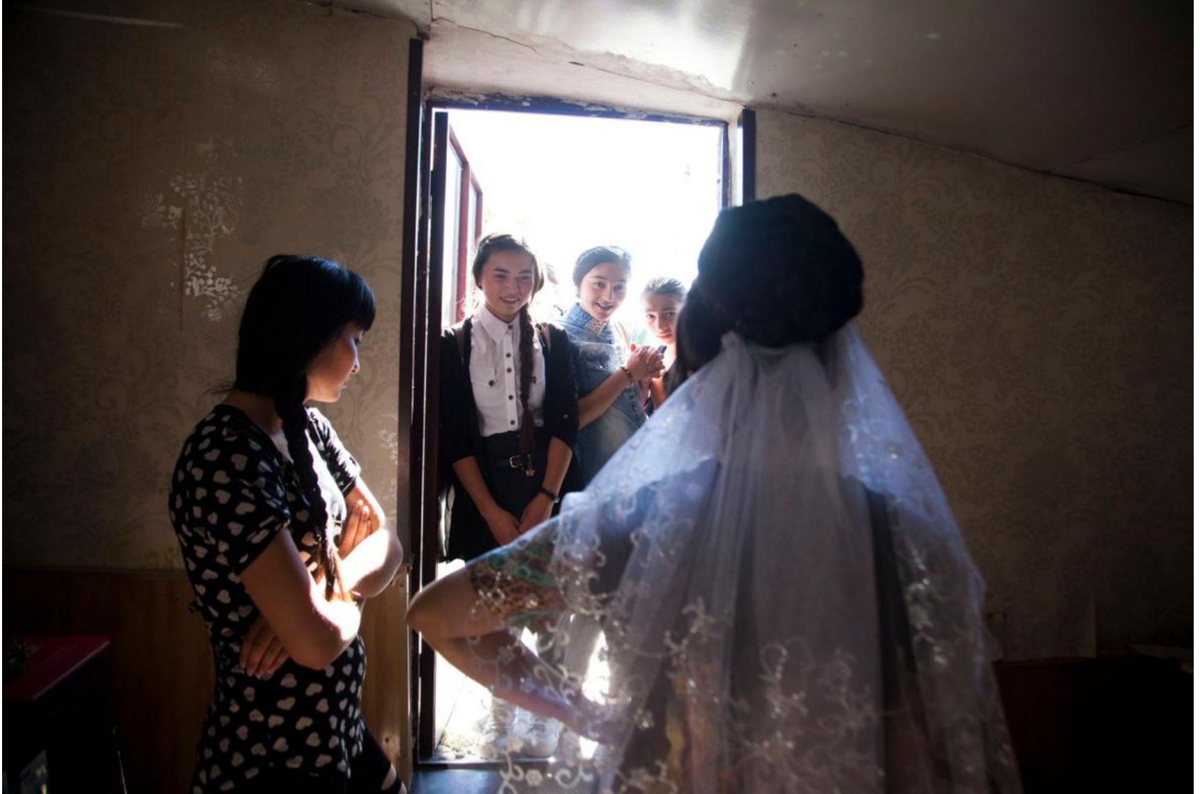
A bride's classmates visit her before the wedding to admire her dress