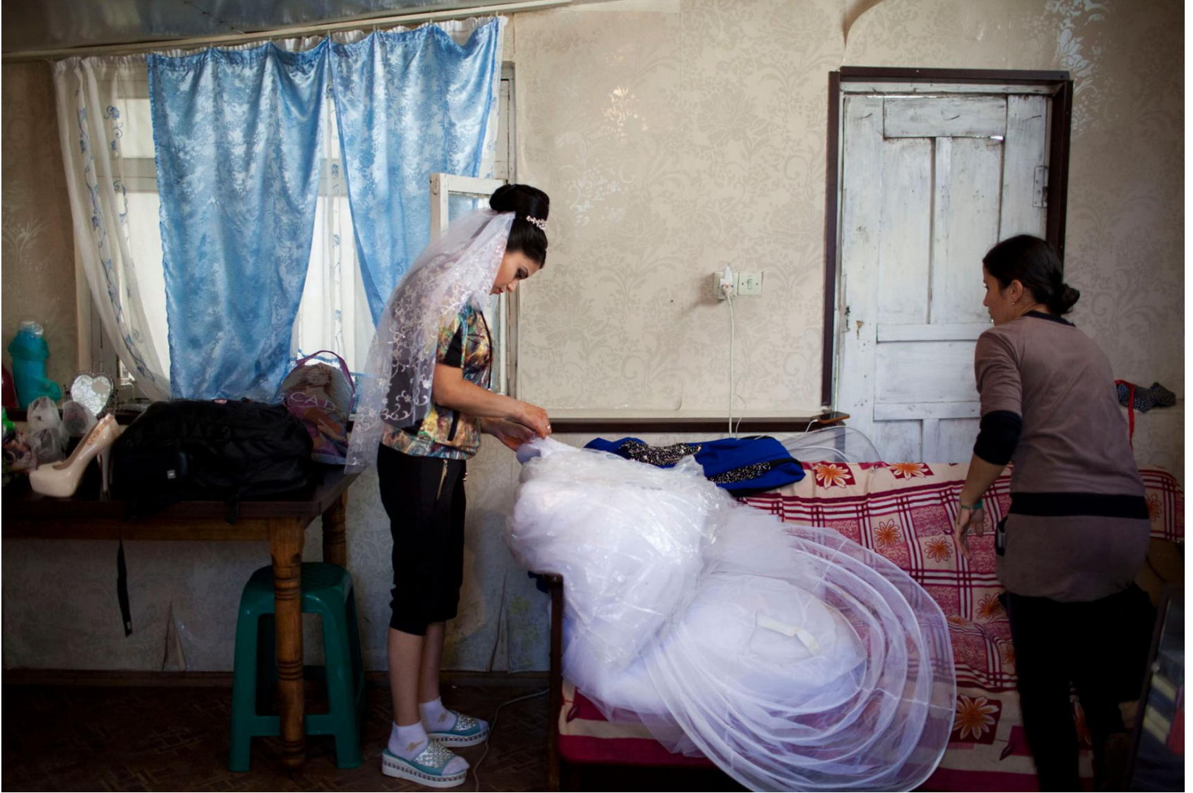
At a salon in the village, a bride gets ready for her wedding ceremony